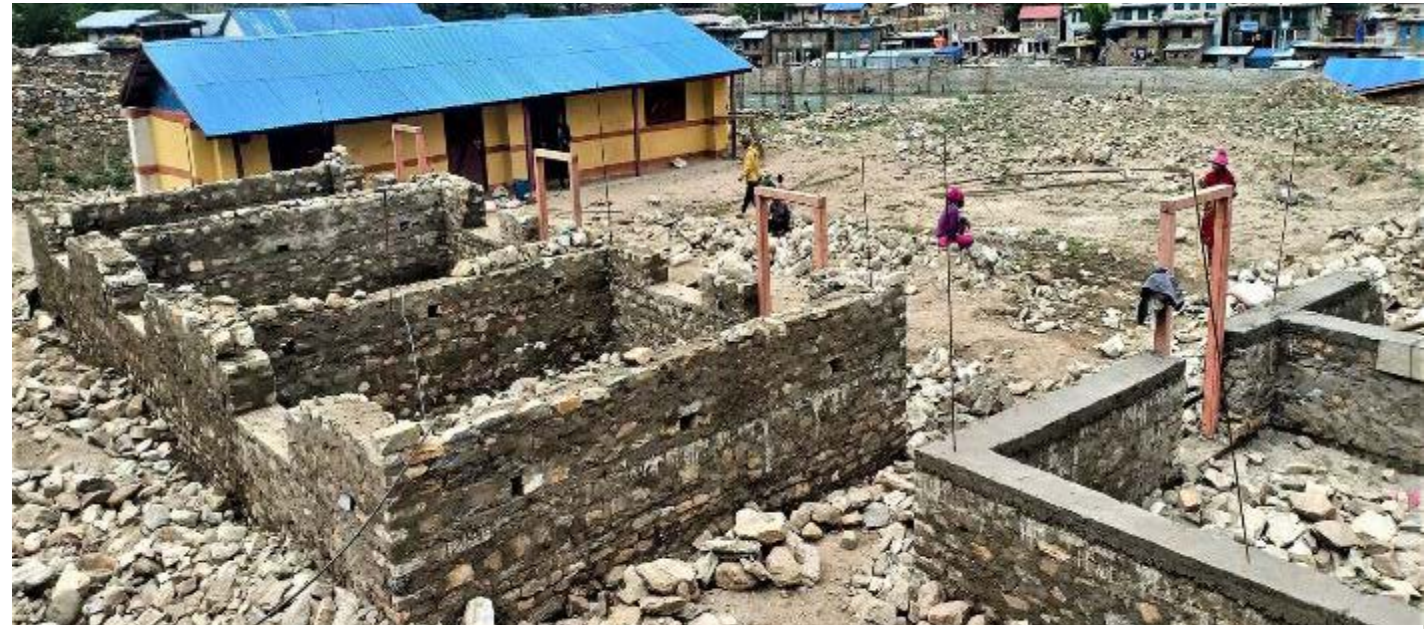
Figure 29 School building under construction in Dolpa