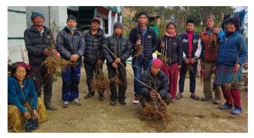
Figure 13 Fruit seedlings distribution