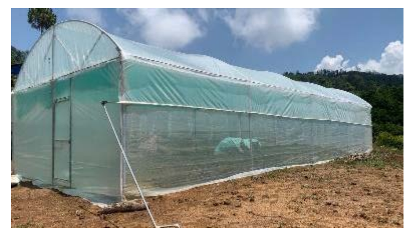
Figure 14 Hi-Tech tunnel set up at Aiselukharka