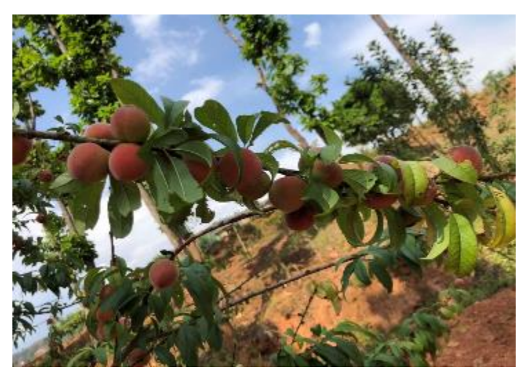
Figure 4 Peach fruit at MDAFRC