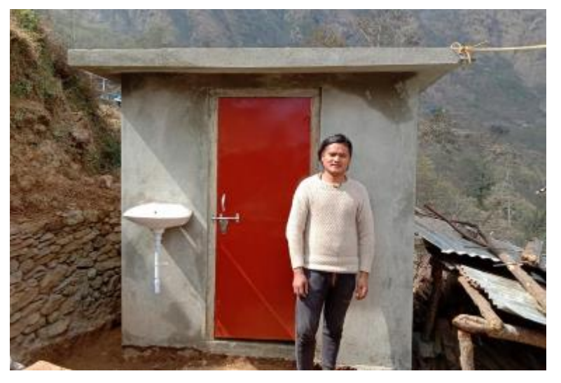
Figure 32 Single compartment with handwashing facility