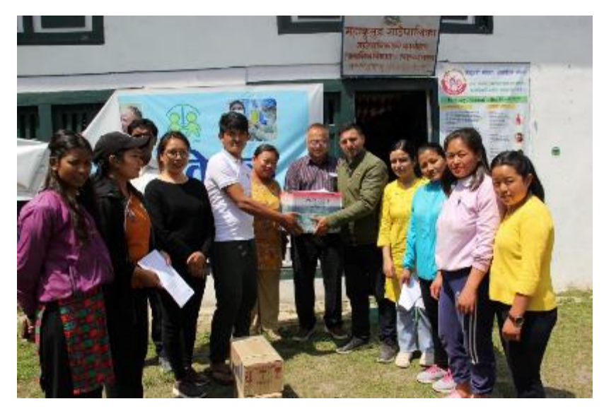
Figure 41 Health equipment handed over to health facilities of MRM