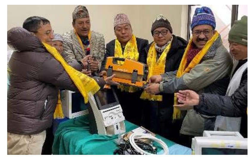
Figure 39 Health equipment handover to Phaplu Hospital