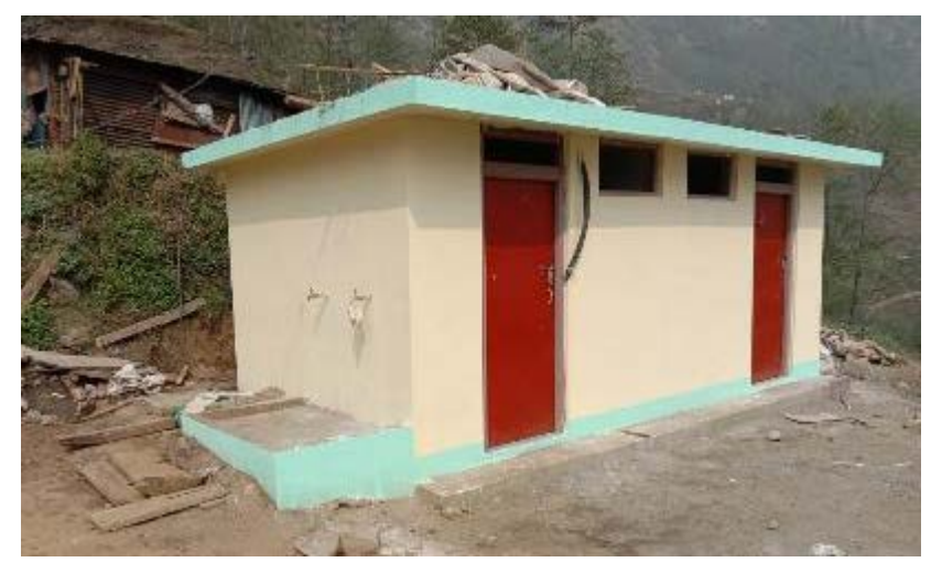
Figure 37 newly constructed double compartment toilet at Duguna