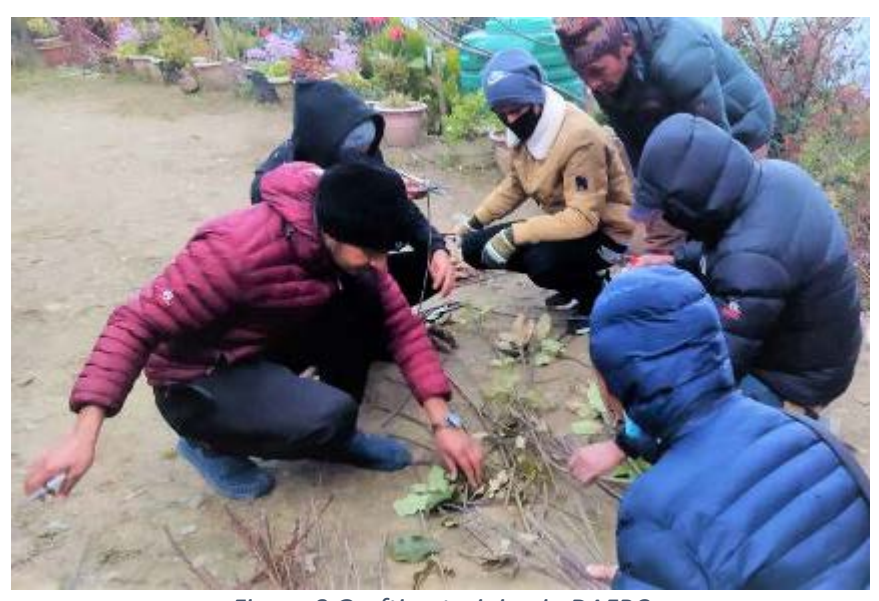
Figure 8 Grafting training in DAFRC