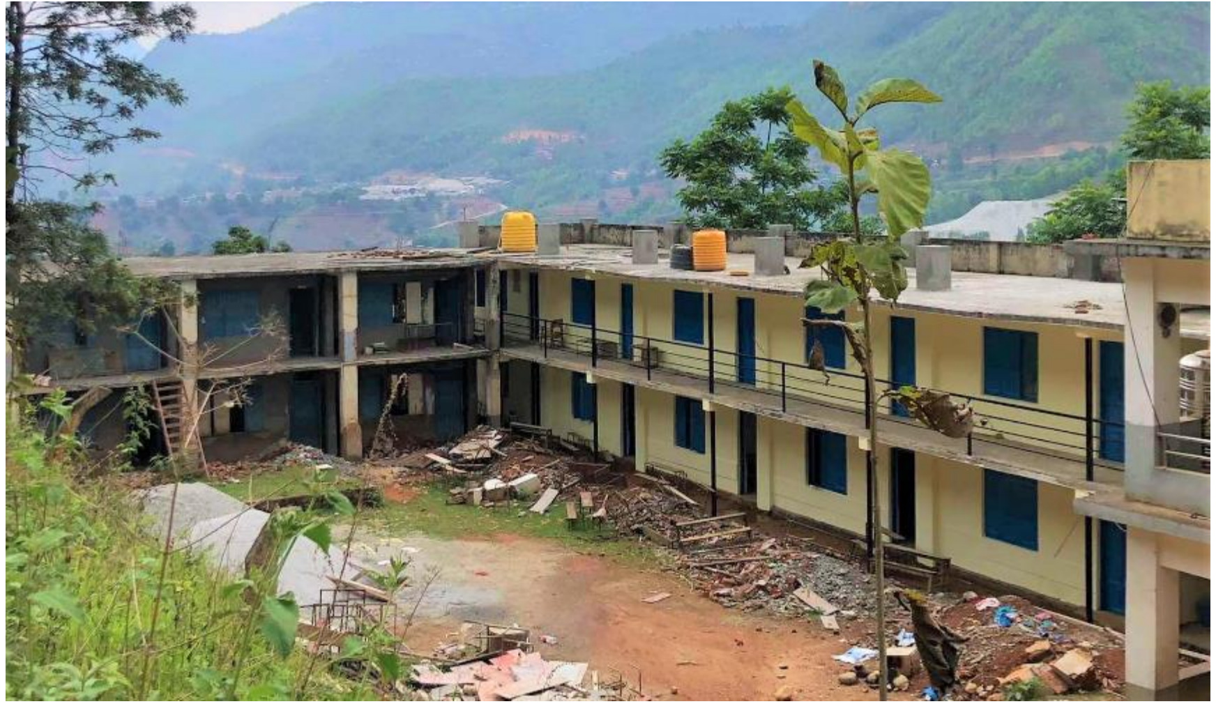
Figure 28 BLOCK A and BLOCK B of Indrawati SS at a glance