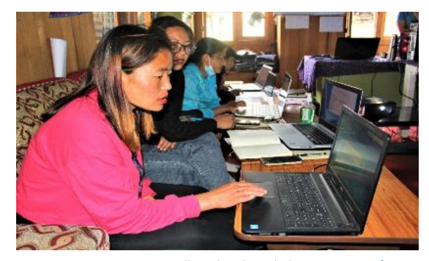
Figure 46 Participant excelling their knowledge in using Firefox