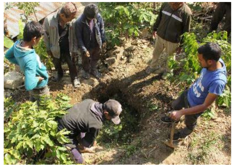
Figure 7 Bio intensive Training in DAFRC