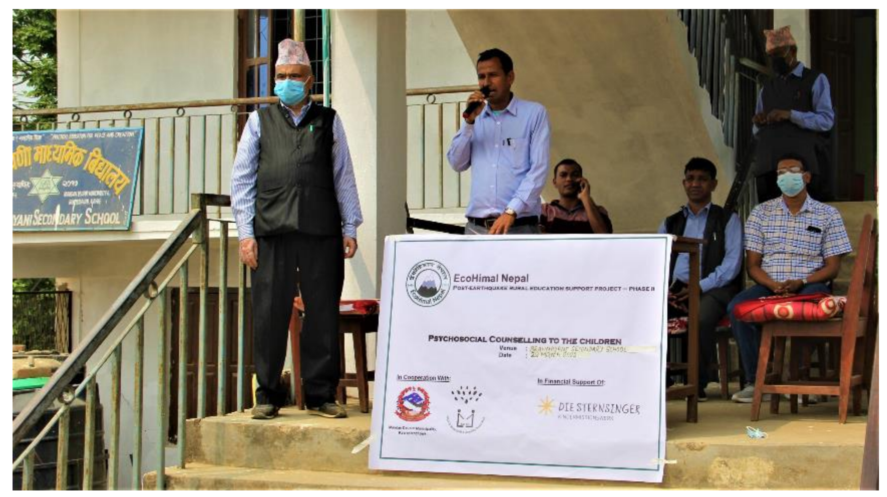
Figure 43 Psychosocial Training inauguration program in Kavre