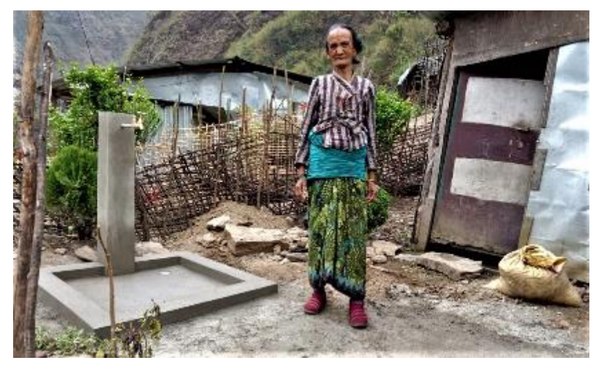
Figure 36 Taps construction completed in Bokchen