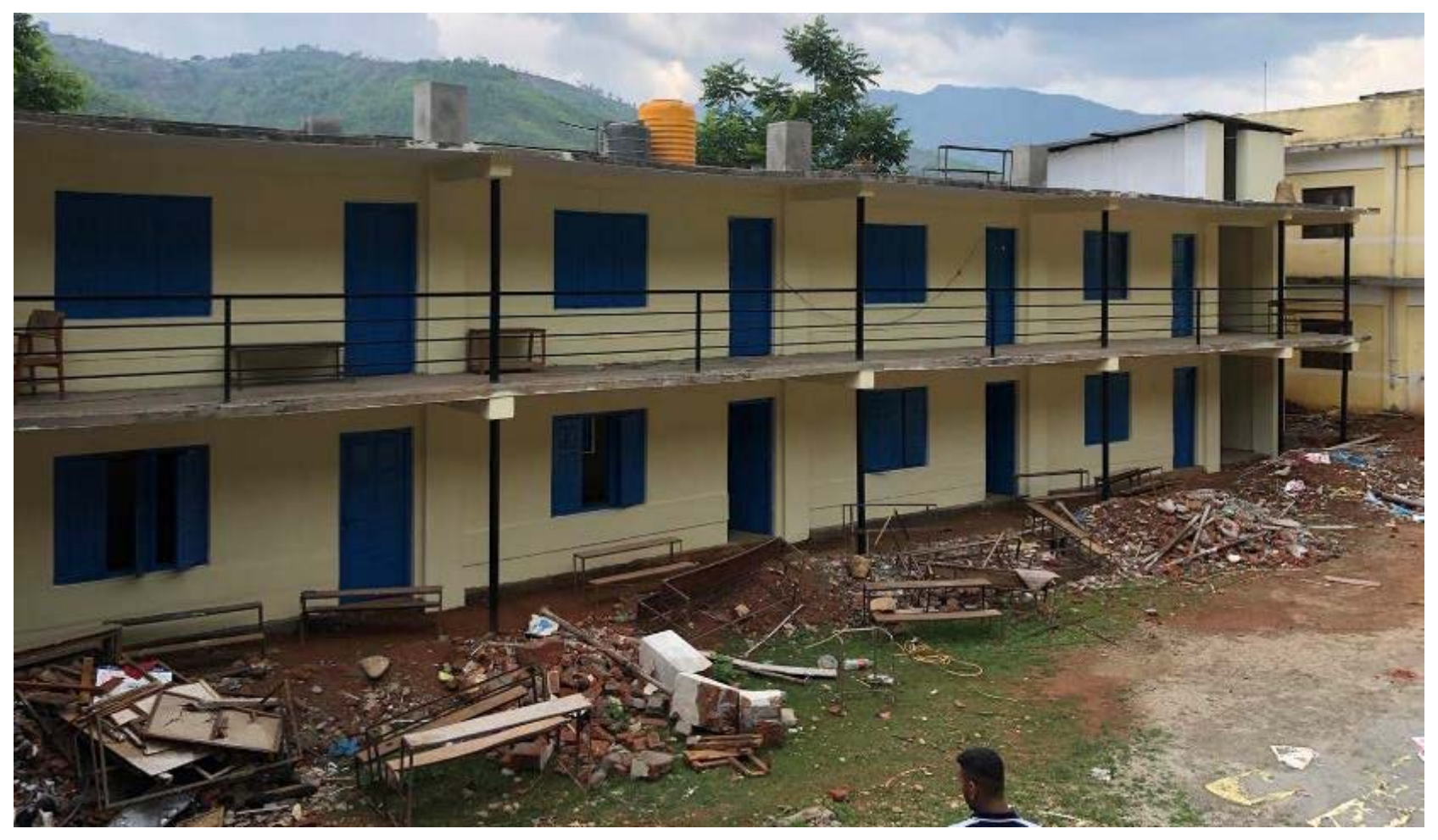
Figure 27 Indrawati Secondary School BLOCK A after retrofitting