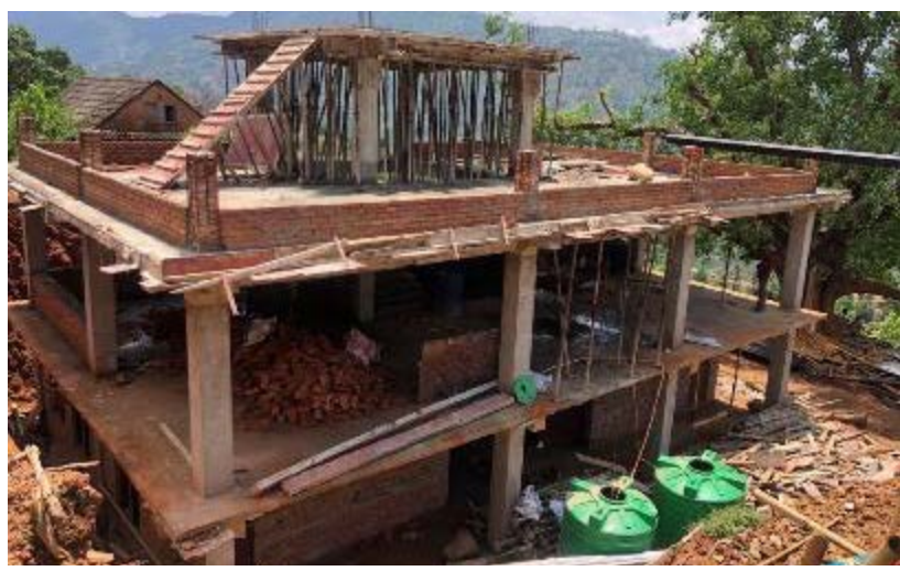
Figure 30 Janajagaran BS under construction