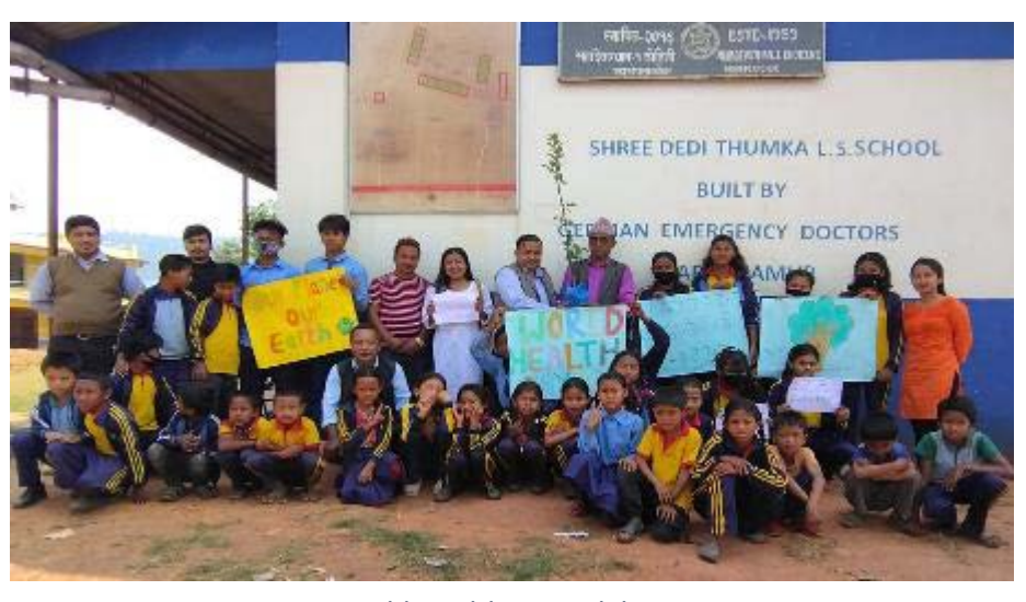
Figure 45 World Health Day celebration in Kavre