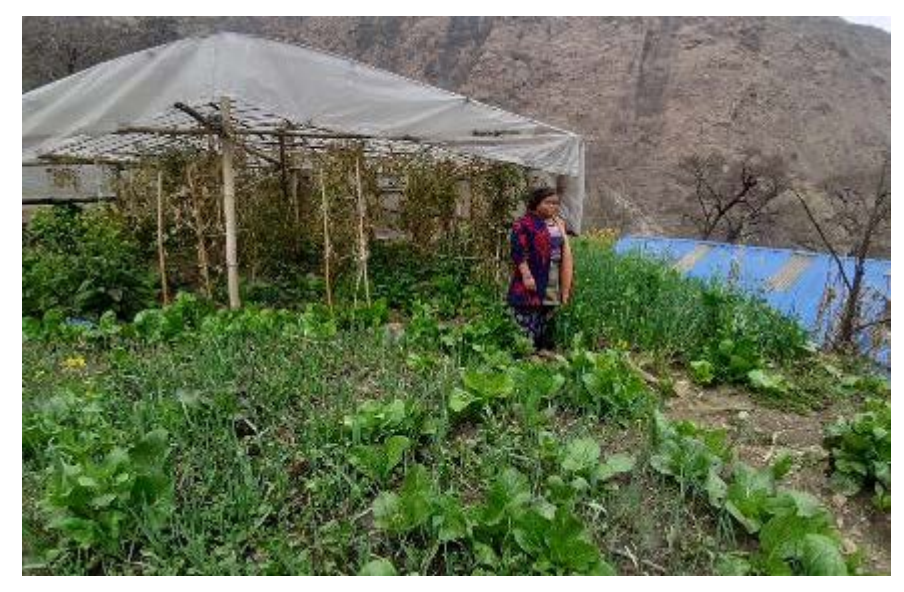
Figure 15 Kitchen garden established in Duguna Village