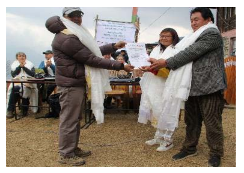
Figure 34 Khiraule Drinking Water project handed over to local government