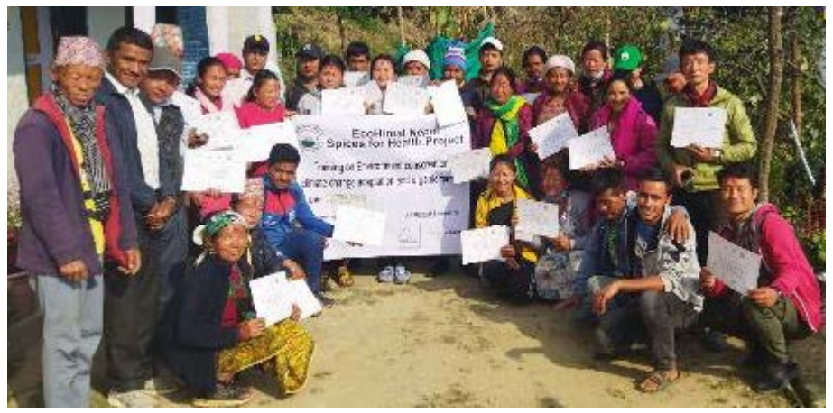
Figure 24 Environment Conservation training