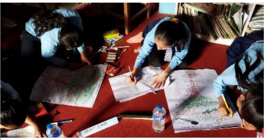
Figure 47 Participants during school based psychosocial counselling conducted in Kavre