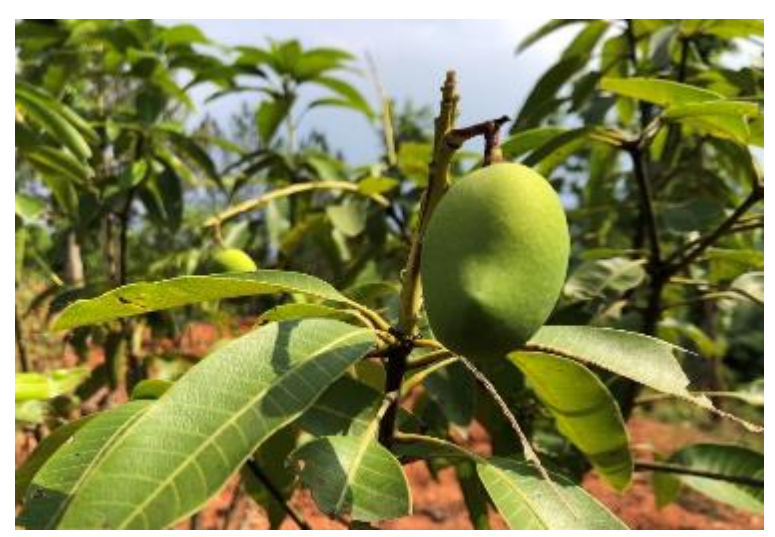
Figure 3 Mango Fruit