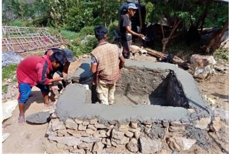
Figure 31 Biogas plant construction in Duguna