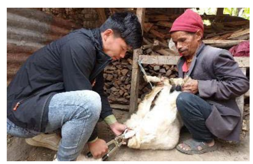
Figure 9 Castration of He goat in Dugunagadi