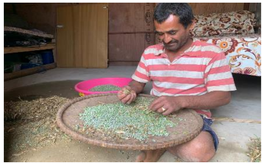
Figure 16 Green peas produced in Aiselukharka AFRC