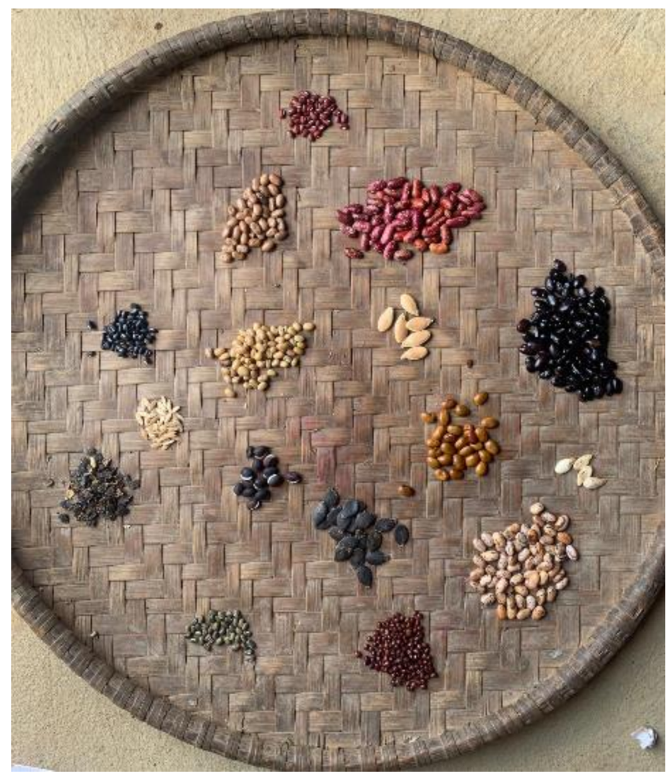
Figure 5 Local seeds collection in Khotang