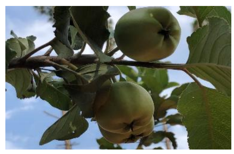
Figure 1 Apple Fruiting