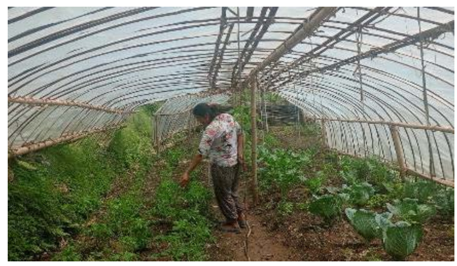
Figure 17 Vegetable farming by local farmer in Khotang