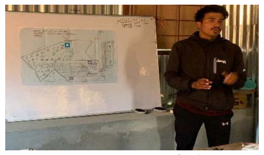
Figure 18 Resource centre presenting farm design