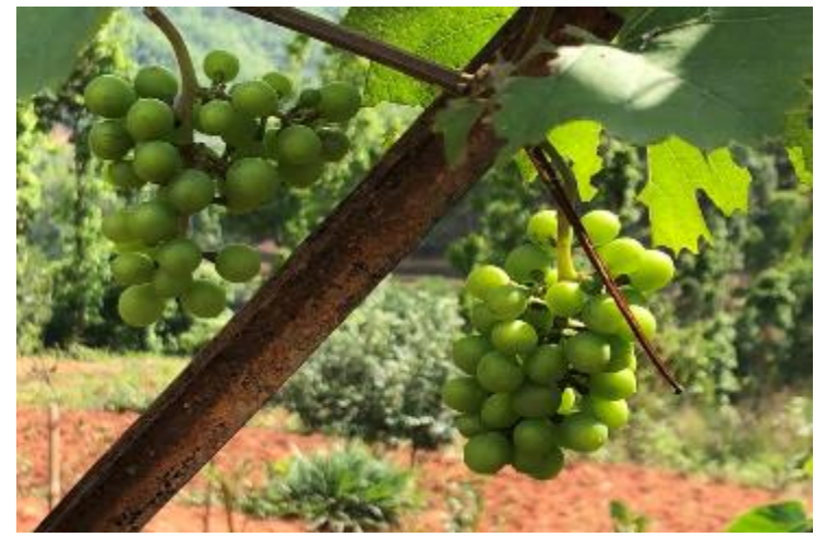
Figure 2 Grapes fruiting at MDAFRC