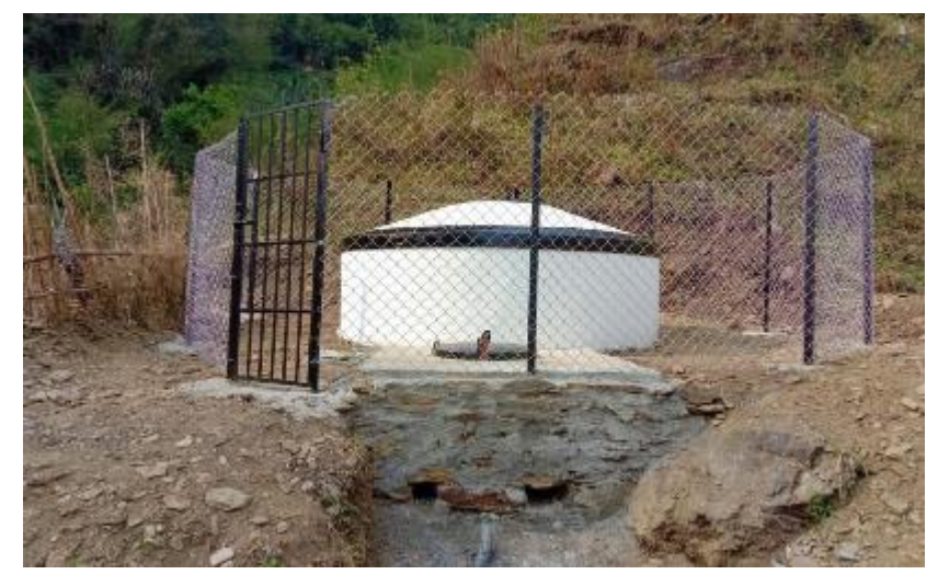
Figure 35 Reservoir Tank constructed in Bokchen