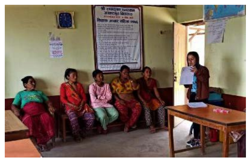
Figure 44 Orientation to parents about the importance of education