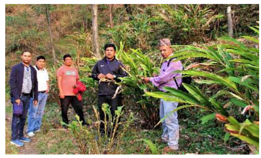
Figure 11 Cardamom Quality inspection of by TAAN and Nepal Tourism Board