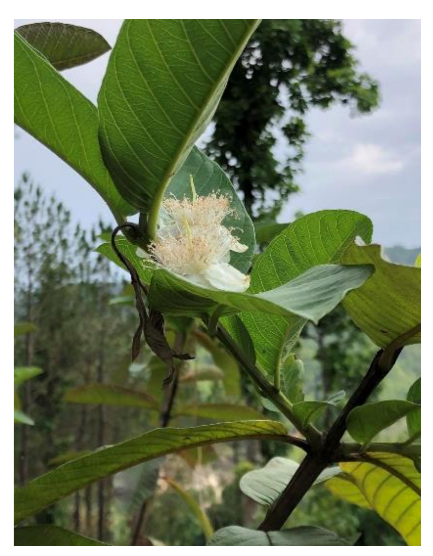
Figure 6 Guava Flowering