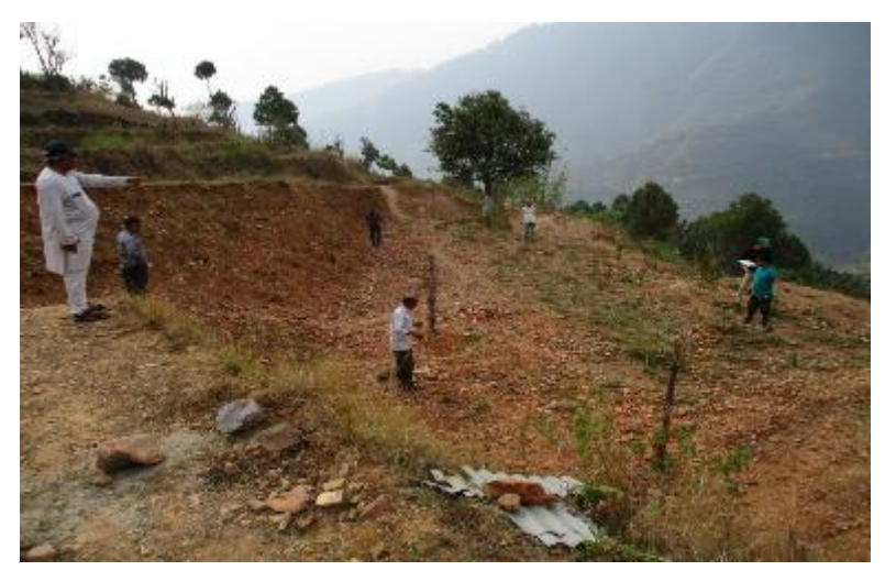
Figure 12 Demonstration of farm design training