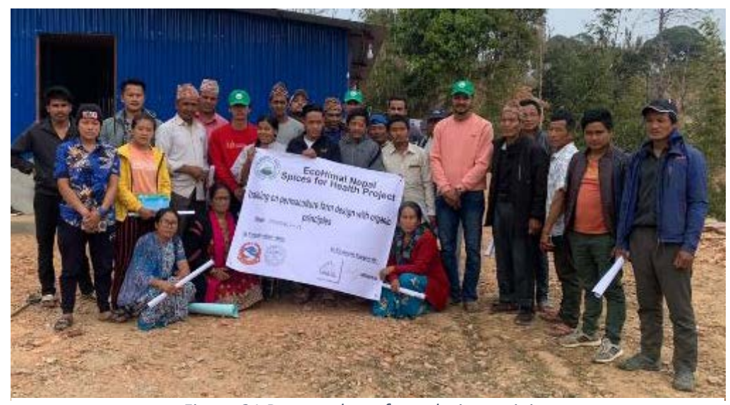
Figure 21 Permaculture farm design training